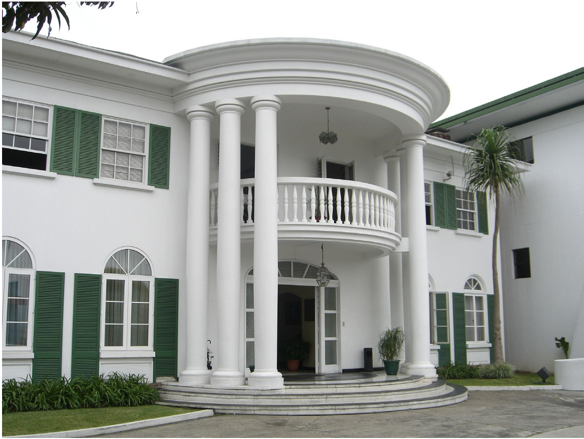
Inter-American Court of Human Rights